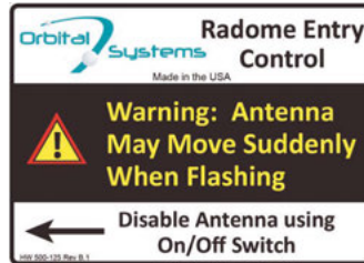
Radome Entry Control Module Label