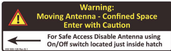
Exterior Radome Warning Label