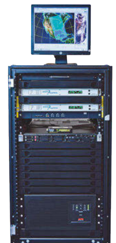
*Optional Rack Enclosure Half Height Rack